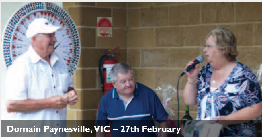
Domain Paynesville, VIC – 27th February

A number of Domain residences have been opening their doors and hosting community days to showcase their facilities. This month we report on Domain Paynesville, Domain Coffs Harbour, Domain Florence Tower and Domain South Valley.