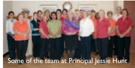
Some of the team at Principal Jessie Hunt