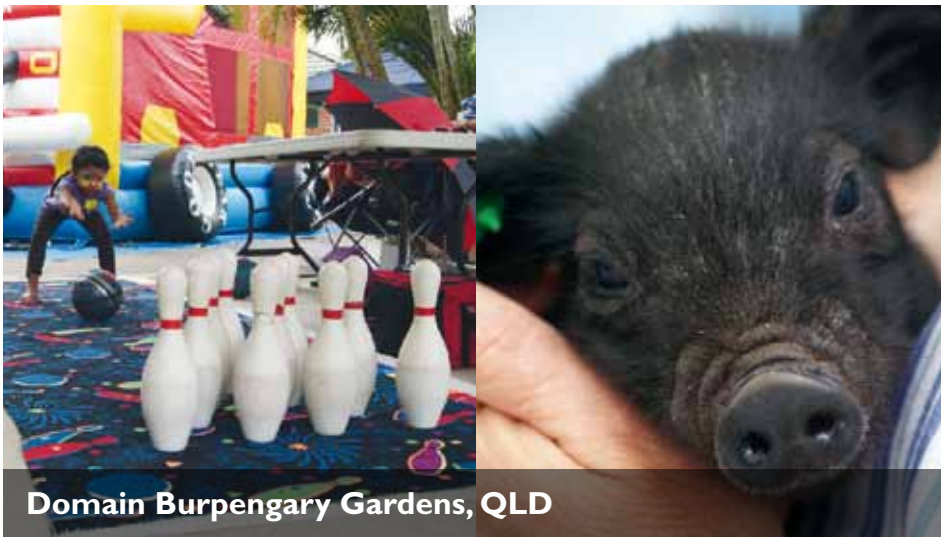
Domain Burpengary Gardens, QLD