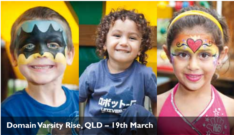
Domain Varsity Rise, QLD – 19th March

The rain didn't dampen anyone's spirits as Domain Varsity Rise held its community day on Saturday 19th March. Like Raffin Place, visitors to the event had the opportunity to have their antiques valued by The Gold Coast Antique Centre and listen to new and classic hits from Gingers Jazz.