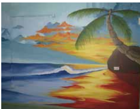
The mural in the Jacaranda lounge