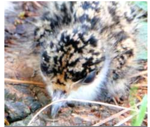
The rescued plover

The Fernleigh residents and staff are not unaccustomed to plover chick rescues – last year the maintenance officer rescued a pair of chicks from the roof and can be seen in the photo with other staff decked out in 'PPE' - that's Plover Protection Equipment - to prevent the adult plovers from attacking them.