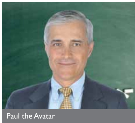
Paul the Avatar

Innovative knowledge delivery approaches are greatly needed across the sector and DPG is doing just that. In Victoria for instance the L&D team will be using a talking avatar or virtual trainer, Paul, to assist us in delivering a number of the forthcoming training sessions. We would like you to join us in welcoming him and we hope you enjoy your sessions with him.