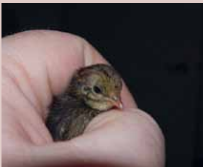
The baby quail

And finally some good news on the baby quails at Principal Berkeley Village (NSW). On 21st November staff came to work to find four gorgeous baby quails! Mother and babies are all doing well.