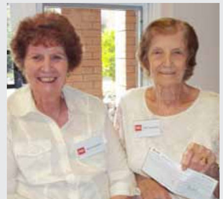
MS volunteers on the day