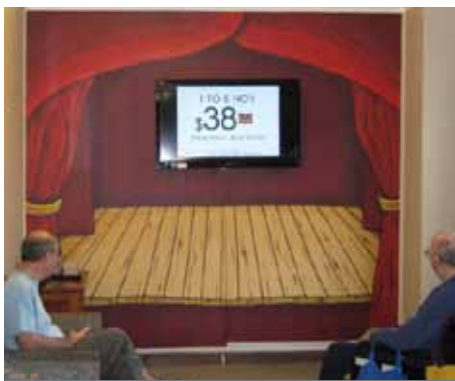
Residents enjoy their new movie wall

Feedback has been very positive with comments such as “I love this room, it is so colourful” and “I feel like we are at the Opera House”.