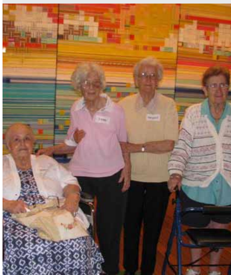
Residents enjoy the experience

Maitland Regional Art Gallery is facilitating a six-week pilot program with six of Principal Hillside's (NSW) residents. The program, aimed at people with Alzheimer's, is designed to improve the wellbeing of people living in aged care homes with various forms of dementia.