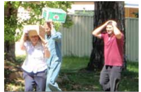
Fernleigh staff with their PPE