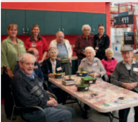
Thank you to Bunnings and our friends from Hibiscus Gardens for our Bonsai workshop

The staff at Domain Auckland Place know the importance of ensuring that everyone has plenty to do and recognise the value of ensuring that residents can get out and about in the local community whenever possible. A workshop recently hosted by the local Bunnings gave residents the opportunity to learn more about Bonsai trees. Here is the group pictured during their workshop.