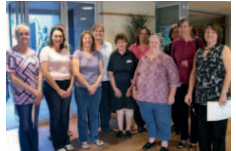
Domain Parklands staff inspecting Domain Auckland Place

Even though the Parklands residents are moving to a newer residence many are feeling unsettled by the forthcoming change and staff have worked with them to make the transition